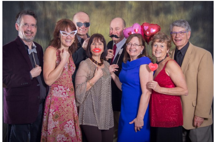
Pictures from the Wake County Shrine Club Sweethearts Dinner Dance, February 17, 2018.

Tickets include dinner, served at 7:00pm