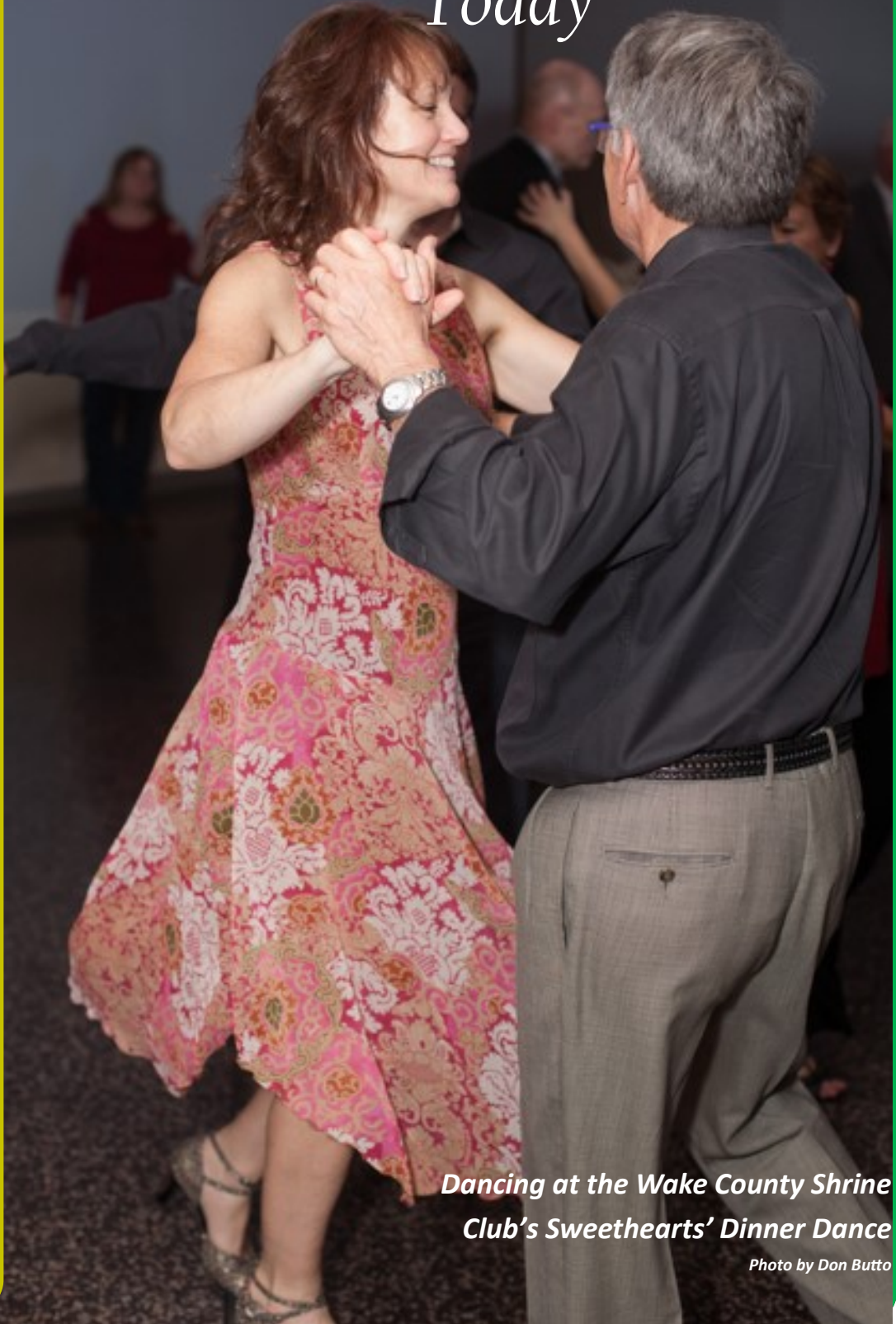
Dancing at the Wake County Shrine Club's Sweethearts' Dinner Dance