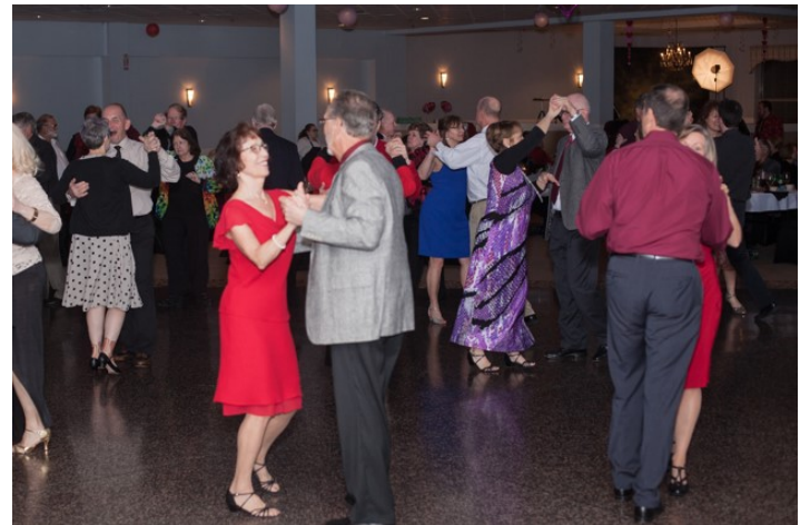
Burlington Shrine Club 2018 Officers Installation