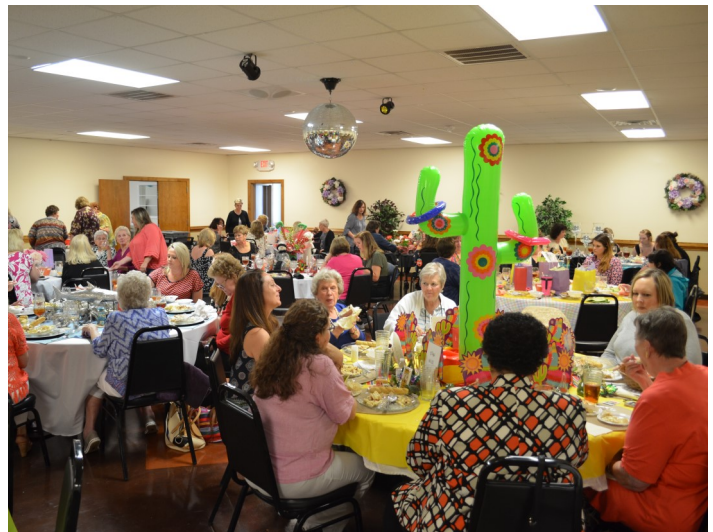
Full house at the Triangle SC Ladies' Luncheon.