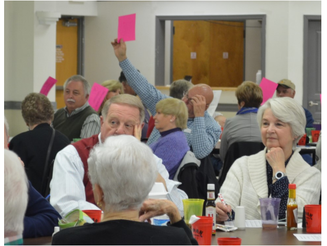
Winning at the Amran Temple Reverse Raffle