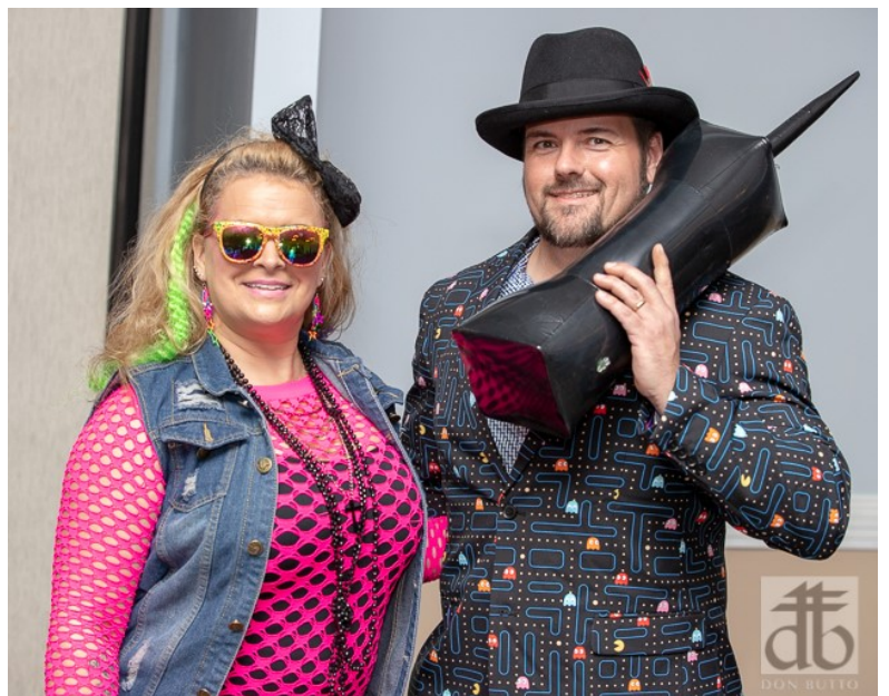
Back to the 80's at the Wake County Shrine Club!