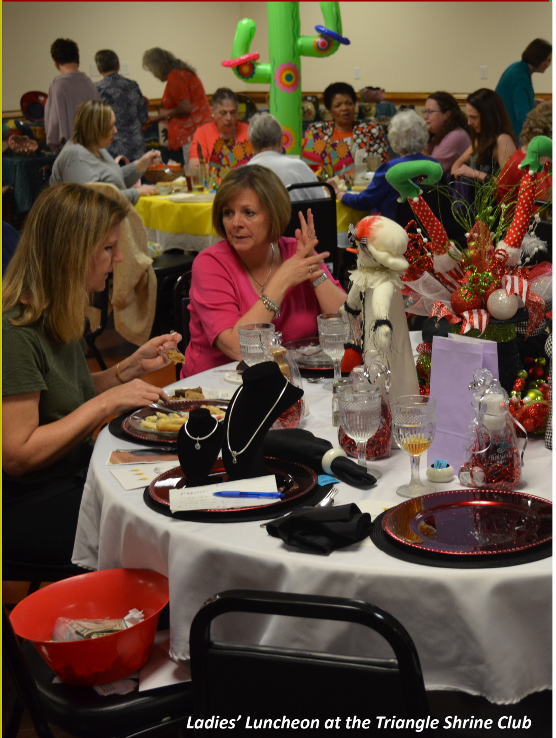
Ladies' Luncheon at the Triangle Shrine Club