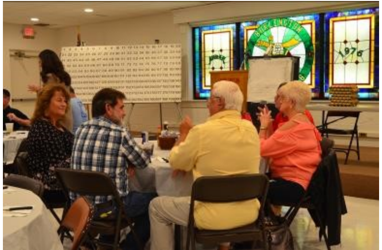
Reverse Raffle at the Burlington Shrine Club

Dress is coat and tie with service ribbons for LOH members and veterans, and coat and tie for all other men. Ladies can dress business casual, please no jeans.