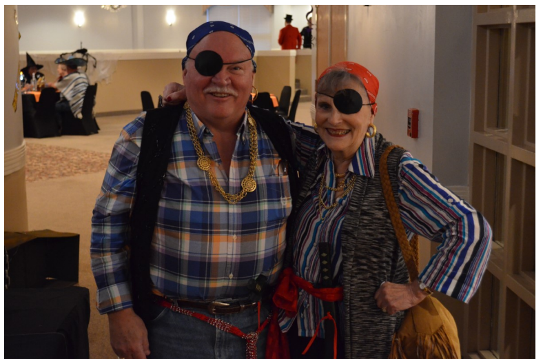
Halloween Night at Wake County Shrine Club