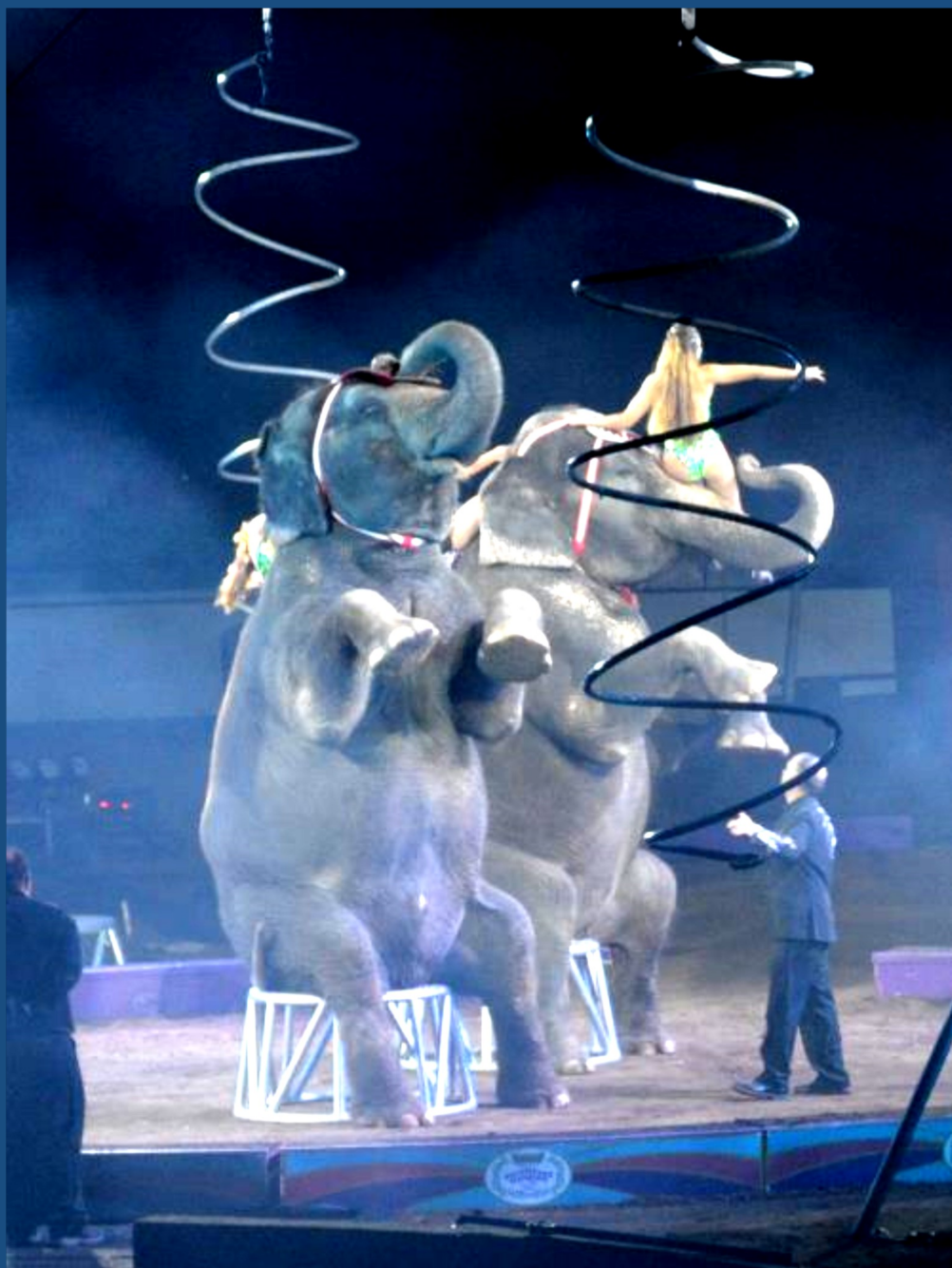
Elephants Performing at the Shrine Circus