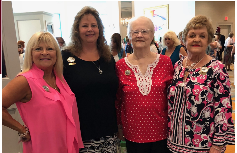
Divan Ladies Night at Imperial Shrine Session 2018