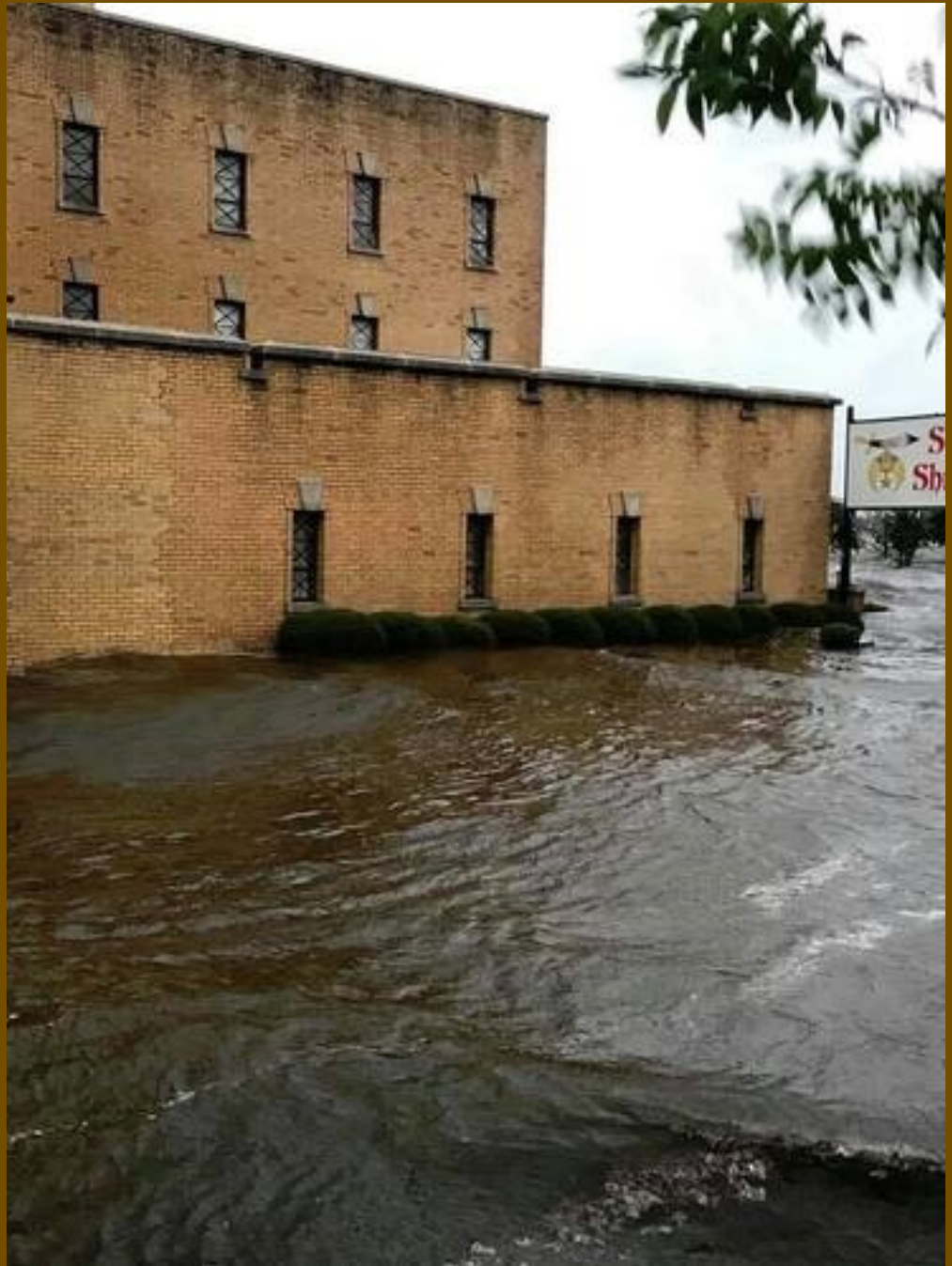
Flooding from Hurricane Florence at Sudan Temple in New Bern