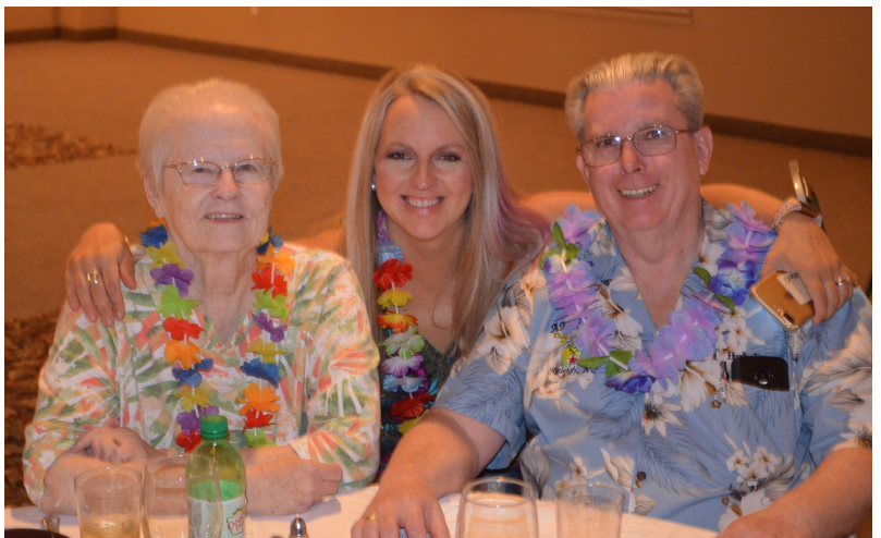
Luau Night at Wake County Shrine Club