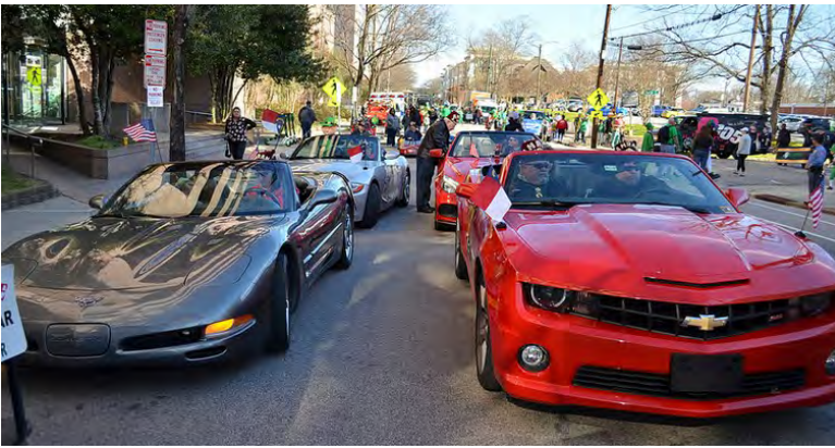
Members of the Ragtops