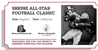
Fig. 1: Sample ticket for charitable fundraiser

Information about our health care system (obtainable from the marketing and communications department), such as patient success stories, facts and figures, photos or other appropriate material, may be used in programs for charitable fundraisers. [See figure 2.]