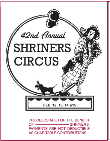
Fig. 4: Sample program cover for fraternal fundraiser

All promotional material, tickets, programs and documents must contain a Statement of Purpose and Disclosure. [See figure 3.] Information about our health care system may be used in programs for fraternal fundraisers provided that each contains the appropriate Statement of Purpose and Disclosure.